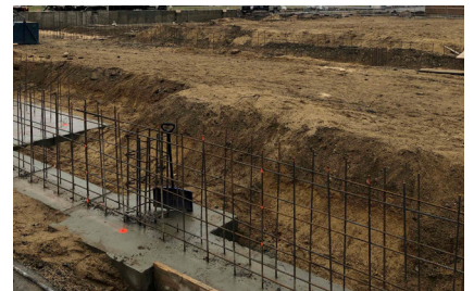
Above: Poured footings for addition.