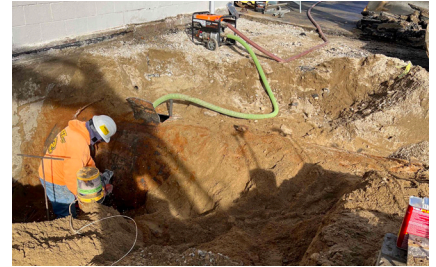
Above: Utility work underway.