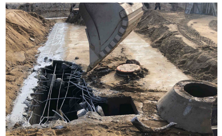
Above: Site demolition.