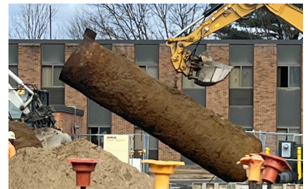
Above: Site demolition.